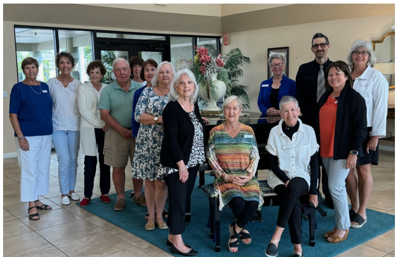
2024 Friends Board of Directors