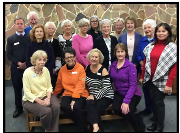
The 2018 Friends of the Punta Gorda Library Board