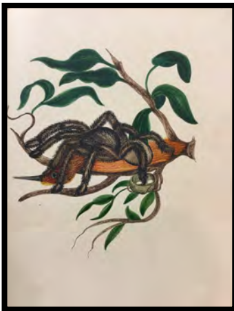
A drawing of a bird-eating spider from the workbooks